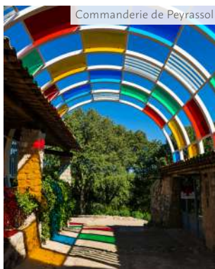
Commanderie de Peyrassol