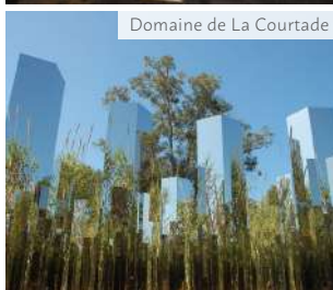
Domaine de La Courtade