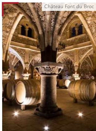
Château Font du Broc