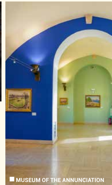
■ MUSEUM OF THE ANNUNCIATION