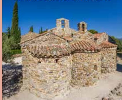
■ THE NOTRE-DAME DE PÉPIOLE CHAPEL