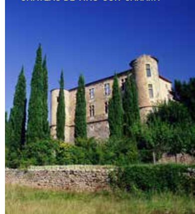
■ CHÂTEAU DE VINS-SUR-CARAMY

FOR CENTURIES THEY HAVE BEEN OVERLOOKING THE VILLAGES FROM THEIR HILLTOPS, OR KEEPING A WATCHFUL EYE IN THE VALLEYS. MAJESTIC FROM THE OUTSIDE, SOME ARE ALSO OPEN TO THE PUBLIC OR EVEN OFFER FESTIVALS AND ACCOMMODATION!