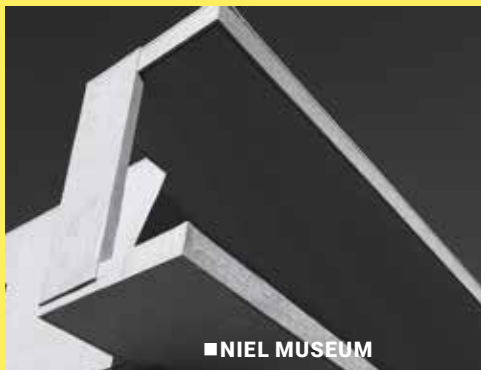
■ NIEL MUSEUM