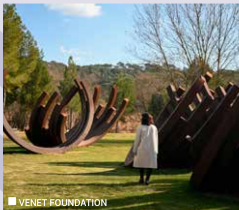
■ VENET FOUNDATION