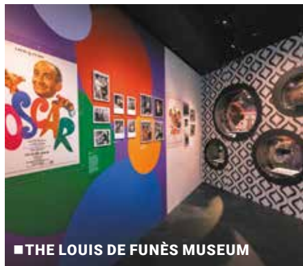
■ THE LOUIS DE FUNÈS MUSEUM