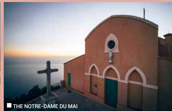
■ THE NOTRE-DAME DU MAI