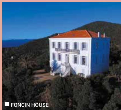
■ FONCIN HOUSE