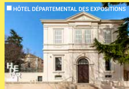
■ HÔTEL DÉPARTEMENTAL DES EXPOSITIONS

This is a key cultural facility! The site of the former departmental archives has been completely renovated to become a unique exhibition space dedicated to history and civilisations.