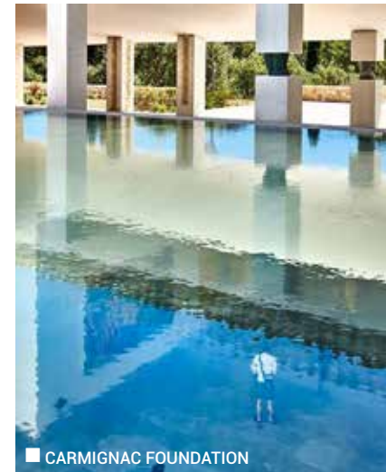
■ CARMIGNAC FOUNDATION