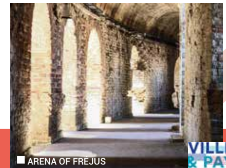
■ ARENA OF FREJUS

Fréjus has retained a large number of buildings from its past. With its 2,000 years of history, this town of Art and History in Le Var has an important historical and architectural heritage, including the Roman amphitheatre and aqueduct.