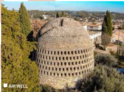
■ AIR WELL