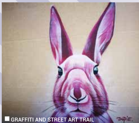
■ GRAFFITI AND STREET ART TRAIL

An open-air museum! In addition, at the beginning of June, the Résonances Urbaines Festival reveals the creative genius of renowned urban artists.