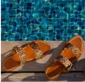
■ K. JACQUES, SAINT-TROPEZ SANDALS

THEY REPRESENT THE LIVING HERITAGE OF OUR REGION AND EMBODY UNIQUE SKILLS AND EXPERTISE. THESE MEN AND WOMEN ARE THE GUARANTORS OF OUR TRADITIONS, BUT THEY ALSO KNOW HOW TO ADAPT TO TODAY'S WORLD THROUGH THEIR GREAT CREATIVITY. COME AND MEET THEM!