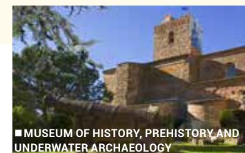
■ MUSEUM OF HISTORY, PREHISTORY AND UNDERWATER ARCHAEOLOGY