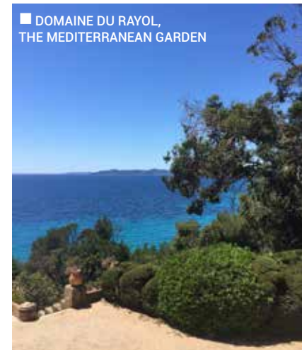
■ DOMAINE DU RAYOL, THE MEDITERRANEAN GARDEN

www.visitvar.fr/circuit-touristique-art-contemporain