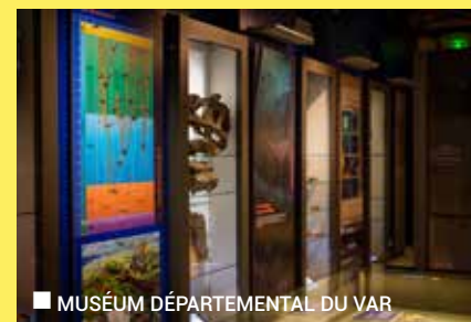
■ MUSÉUM DÉPARTEMENTAL DU VAR

Set in a garden of exotic plants created in the 19th century, the Natural History Museum can be visited by the whole family, where they can learn about the local plants, wildlife and geology. This visit is a must!