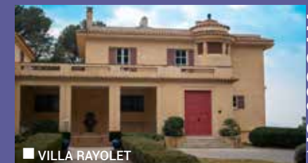
■ VILLA RAYOLET

Recently restored to its original condition, Villa Rayolet is a rare example of a bourgeois holiday home from the 1940s. A permanent exhibition describes the development of the fabulous Mediterranean garden designed by Gilles Clément.