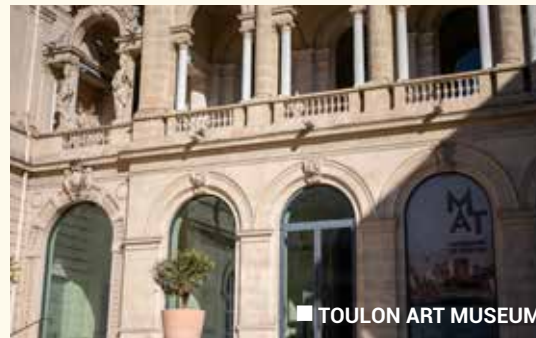
■ TOULON ART MUSEUM