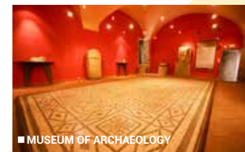
■ MUSEUM OF ARCHAEOLOGY